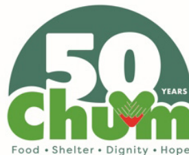
Table Host Guide